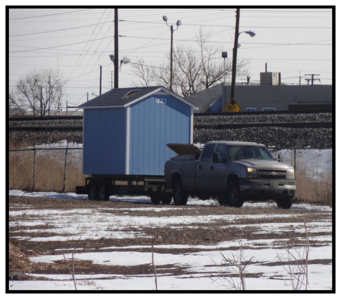
Delivery and set up of 8 X 12 foot shed to Riverside on Feb. 20. The shed will be painted to blend in with the surroundings.